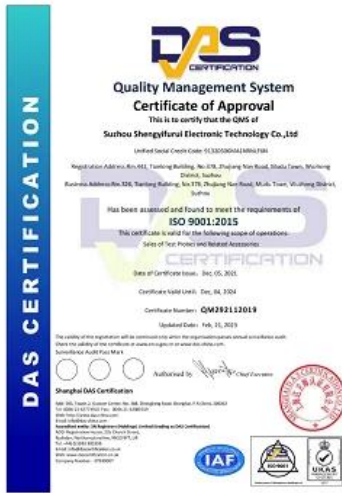
2023 ISO Certificate