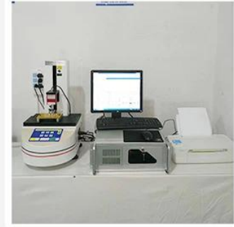
3. Load Curve Meter