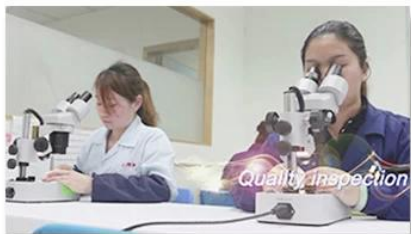
4. Quality inspection