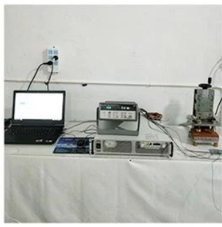
1. Agilent current testing