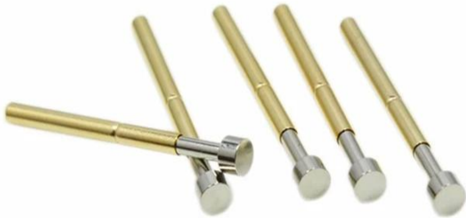
SF-P100 series test probe pin