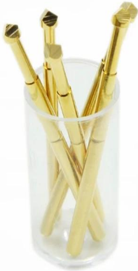
SF-P111 series test probe pin