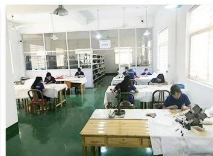
3. Assemble workshop