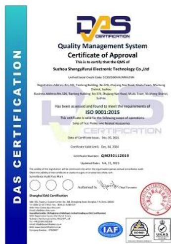
2023 ISO Certificate