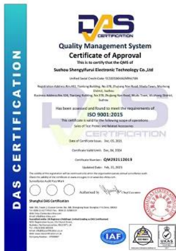
2023 ISO Certificate