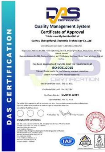
2023 ISO Certificate