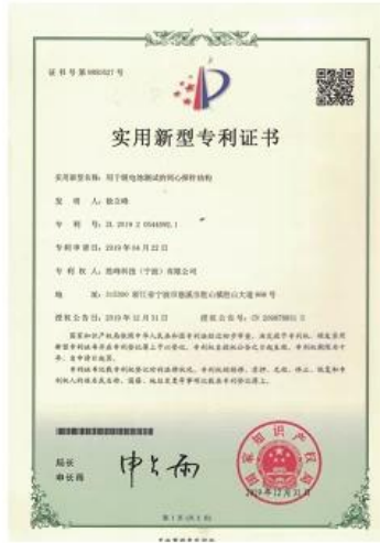
Patent for Coaxial Structure