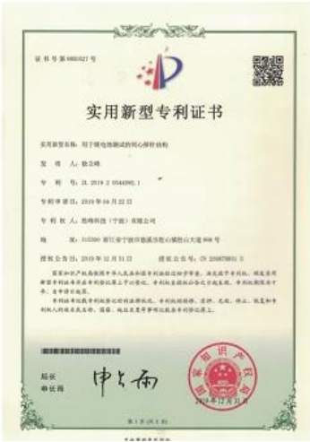
Patent for Coaxial Structure