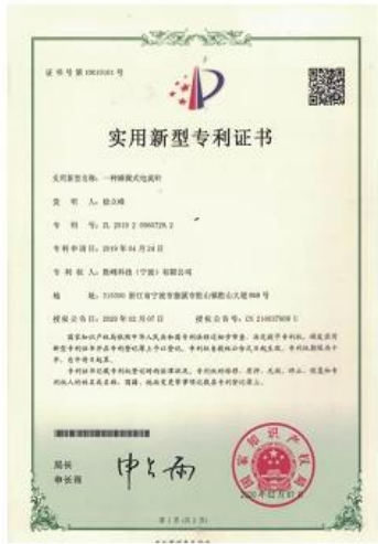
Patent for Honeycomb current probe