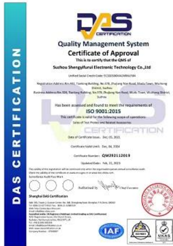
2023 ISO Certificate