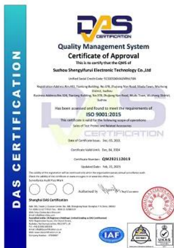
2023 ISO Certificate