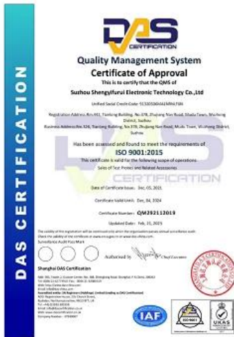
2023 ISO Certificate