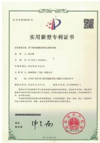
Patent for Coaxial Structure