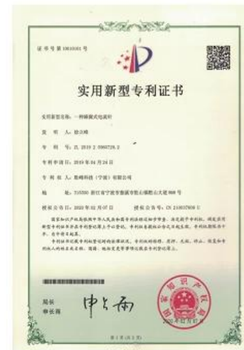
Patent for Honeycomb current probe