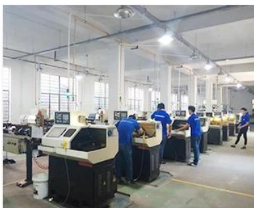
2. Lathe workshop