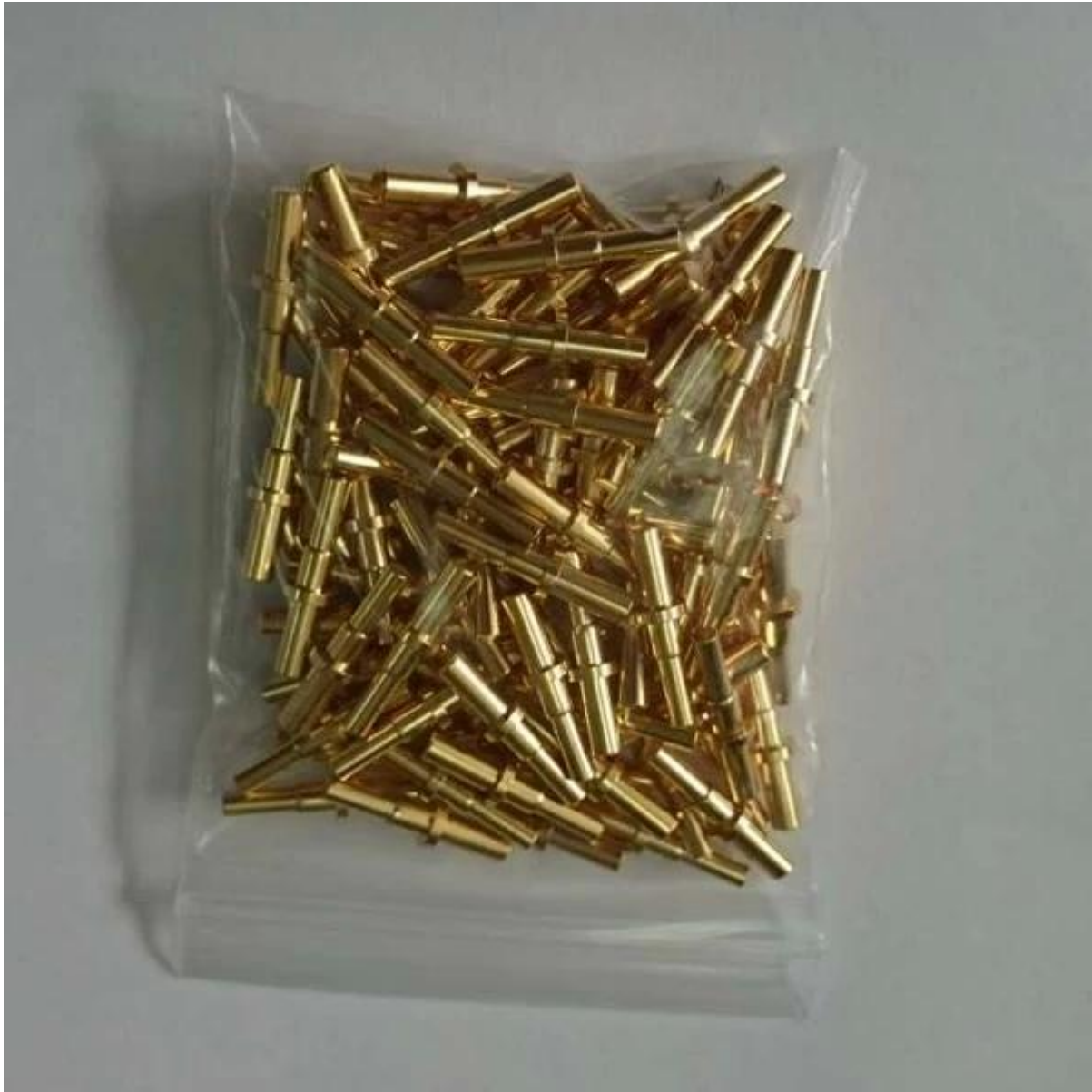
Battery pogo pin connector packing way