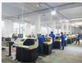
2. Lathe workshop