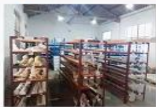
1. raw material warehouse