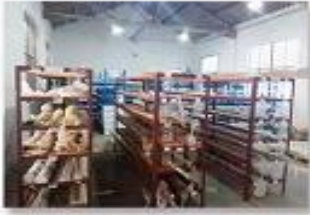
1. raw material warehouse