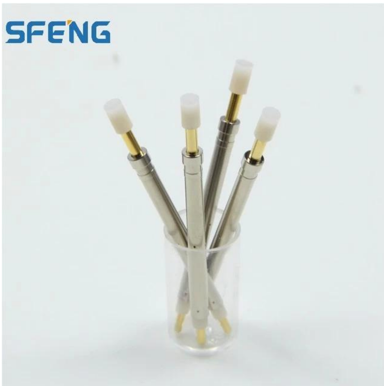
Imagem do produto