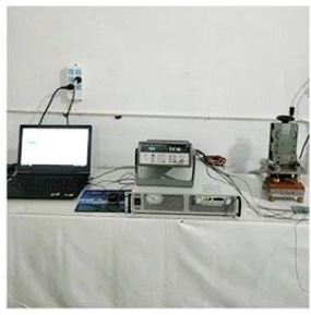
1. Agilent current testing