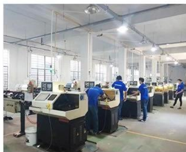
2. Lathe workshop