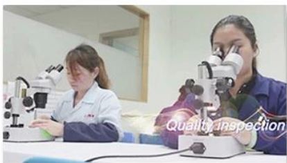
4. Quality inspection