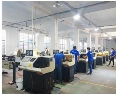
2. Lathe workshop