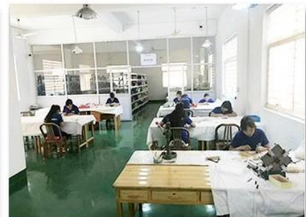
3. Assemble workshop