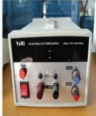
DC power supply