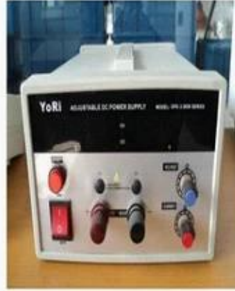
DC power supply