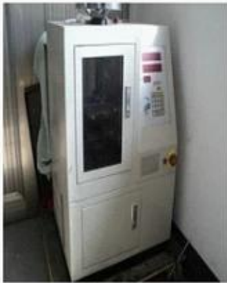
Spring exhausted tester