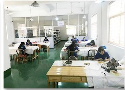
3. Assemble workshop