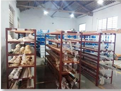
1. Raw material warehouse