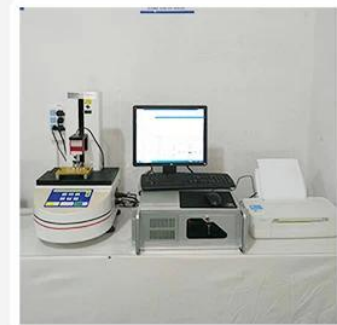
3. Load Curve Meter