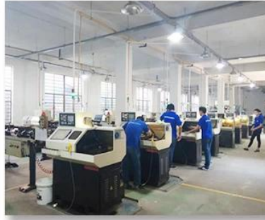
2. Lathe workshop