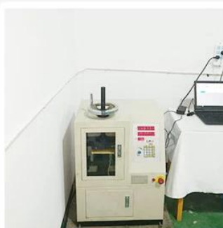
5. Life Fatigue Test