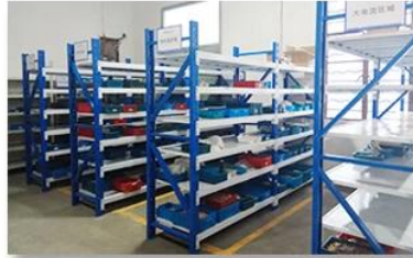
5. Finished products