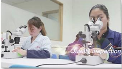
4. Quality inspection