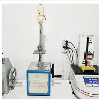
4. Bond Test