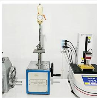
4. Bond Test