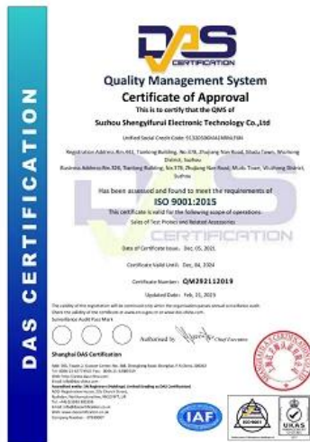
2023 ISO Certificate