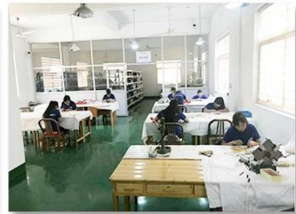
3. Assemble workshop