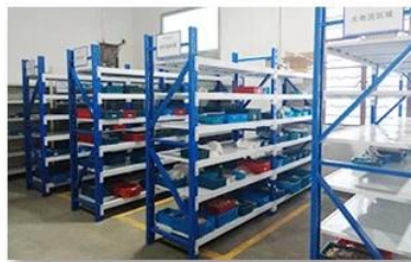
5. Finished products