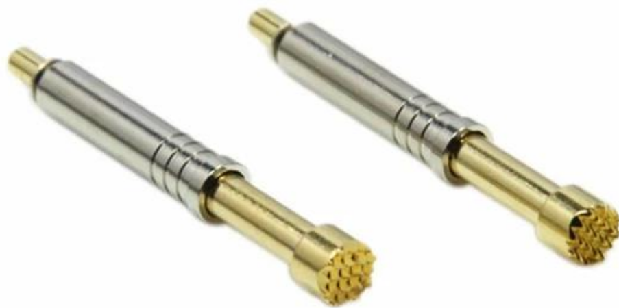
Customized probe pin drawing