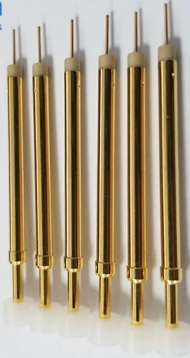
Switching test probe drawing