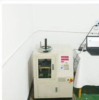
5. Life Fatigue Test