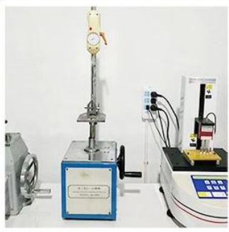
4. Bond Test