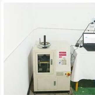
5. Life Fatigue Test