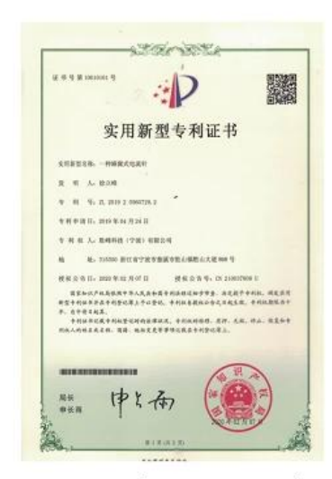
Patent for Honeycomb current probe