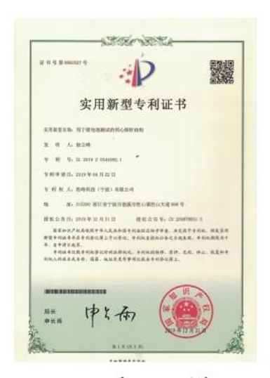
Patent for Coaxial Structure