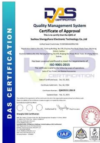
2023 ISO Certificate