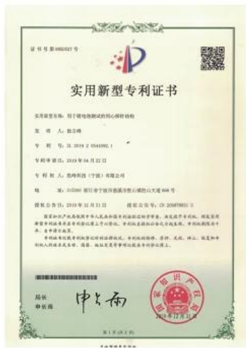
Patent for Coaxial Structure