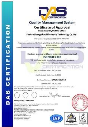
2023 ISO Certificate